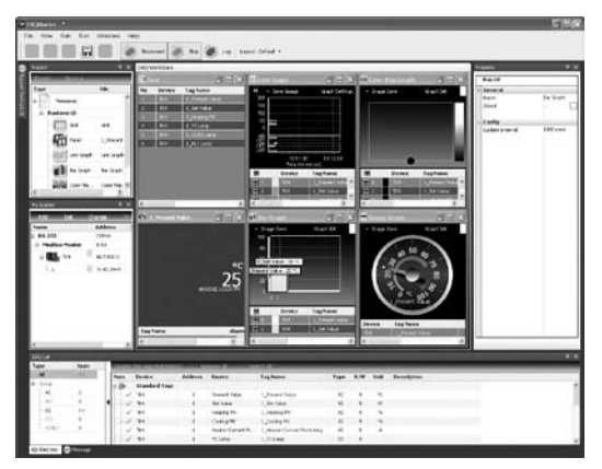
< DAQMaster screen >

XVisit our website (www.autonics.com) to download the user manual and software